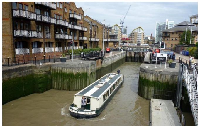
Lock entrance to Limehouse from the river.