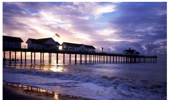
Southwold Pier boasting a restaurant, quirky amusement arcade and shops