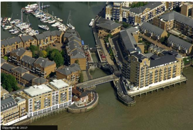
Limehouse dock with River Thames at the bottom of the picture.

The OWYC will be joining up with the Association for 'Greenwich 2018 – The Last Hurrah!' However we will have our own separate Commodore's Cocktail Party on Thursday evening at the Cruising Association HQ, seen on the right side of the dockside as you enter the harbour after leaving the lock. It is a superb club and has five recently refurbished double cabins available all of which have been pre-reserved for OWYC members. Berths for up to 12 boats have been reserved and we look forward to welcoming members with canal boats as Limehouse is linked up the British Waterways canal system