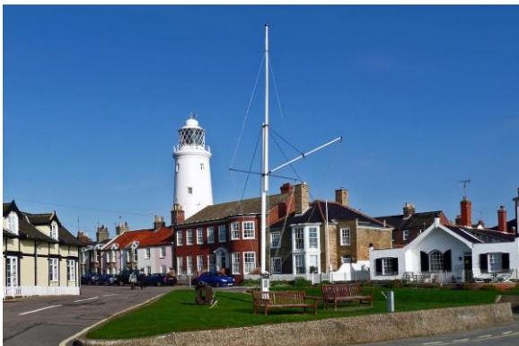
Southwold lighthouse viewed from the sea front.

Southwold is one of the hidden gems of the east coast. What resort can boast both a lighthouse and an independent family brewery (Adnams) in the middle of the town, the only sea pier built in the 20 th century and a high street where almost all the shops are owned and run by independent proprietors? A golf course and heath are a few yards from the high street and the harbour is still full of local fishing boats selling fresh fish from raised clapboard shacks designed to cope with the high tides. For those arriving by boat, you will moor up in Southwold's harbour in the River Blyth, just 20 yards or so from one on the finest pubs in East Anglia, the Harbour Inn, owned and run by the Adnams brewery.